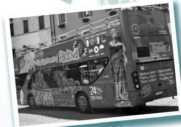
A city bus in Padova.