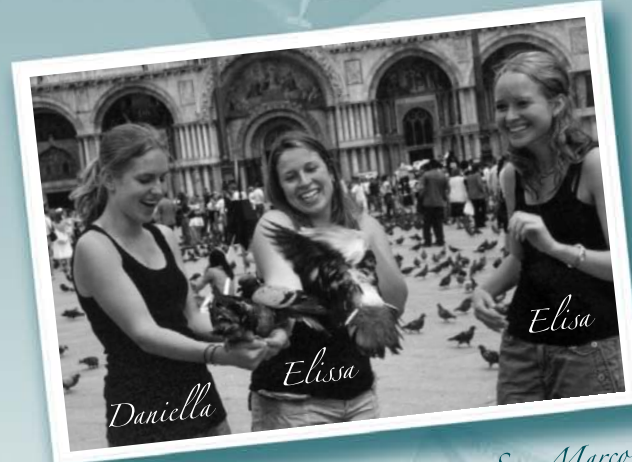
Playing with the pigeons in Piazza San Marco.

One of Fairfield's missions is to provide more than just classroom learning. Extensive opportunities for internships, study abroad, and service learning are hallmarks of the educational experiences provided to students.