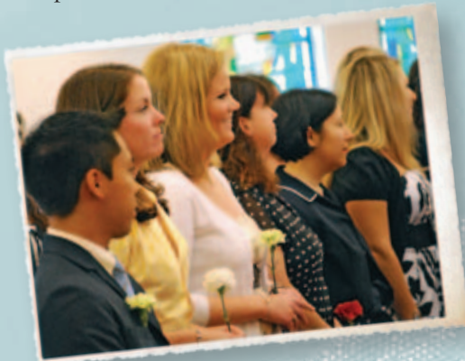
Above: Undergraduate students were all smiles at the May pinning ceremony in the University chapel.

From May through August, the School of Nursing celebrates several graduation and pinning ceremonies with students in nursing programs at the undergraduate and graduate level. As these students leave our campus and embark on the next step in their careers, we wish them godspeed... and hope that they will keep in touch with the School and their professors here.