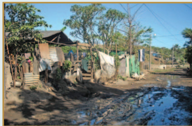
This stream runs through one section of Ayapal and floods during the rainy season, contributing to a host of health problems.