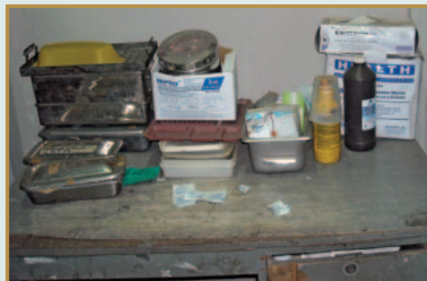
The health clinic that serves the neighborhood tends to run out of medication by the end of each month.

The School of Nursing plans a spring break Study Abroad option in March 2010 and a three week summer option in July 2010.