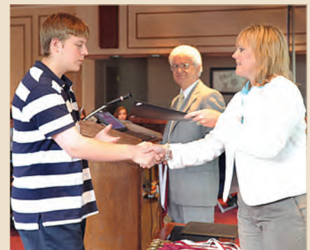
Math and science awards ceremony